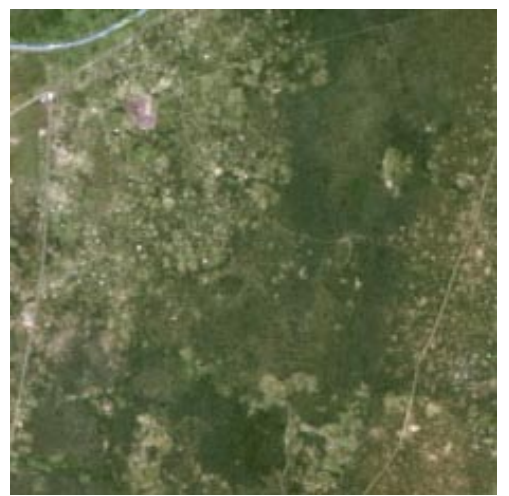
Figure 1a : Section of a Landsat image showing a number of roads, as well as subsistence agriculture and untransformed habitats. The untransformed habitats are generally greener and less fragmented

"pristine" areas. These transects should be located by using a landcover map or satellite image to identify where each should start and which compass bearing it should follow (Figure 1). Some transects may pass close to unmapped roads or fields - this is only of concern when it affects more than half of the transects.